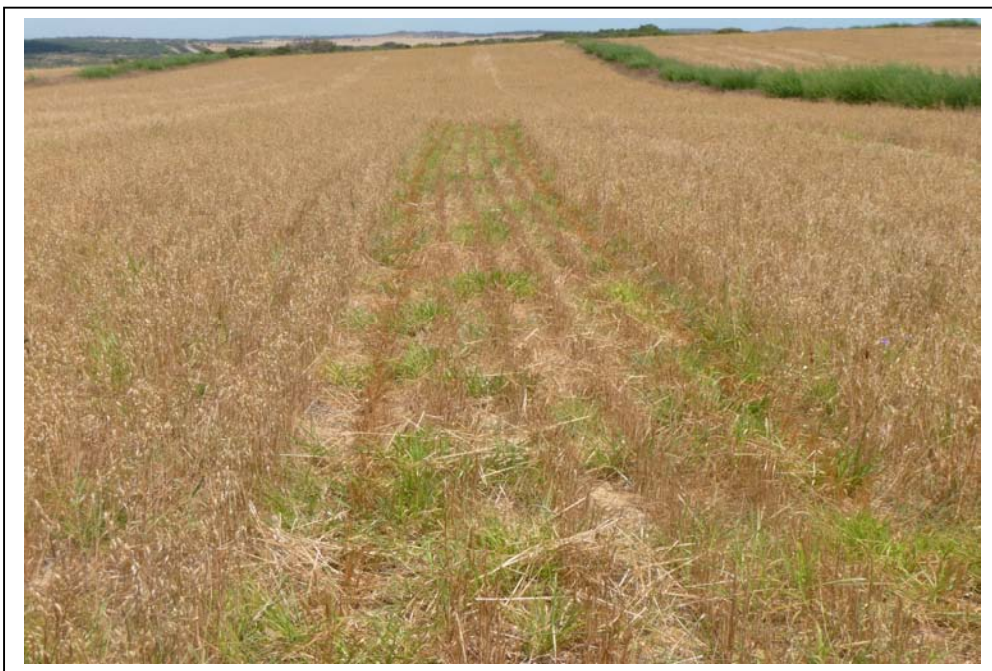
Fig. 2. Pasture cropped paddock on Keith Tunney's property east of Dongara, WA, showing the summer-green perennial pasture beneath a harvested strip of winter oats, sown between alleys of tagasaste. The House of Representatives Standing Committee on Primary Industries and Resources visited this property in September 2009 as part of the Federal Government inquiry into Adapting Farming to Climate Change.

Established summer-green perennial grasses can be oversown with annual grain crops such as wheat, barley, triticale, oats, lupins, chickpeas or canola during their dormant winter phase (Fig. 2). For grazing purposes, mixtures of several crops (eg cereals and legumes) can be sown simultaneously (cocktail cropping) to enhance biodiversity and animal nutrition.