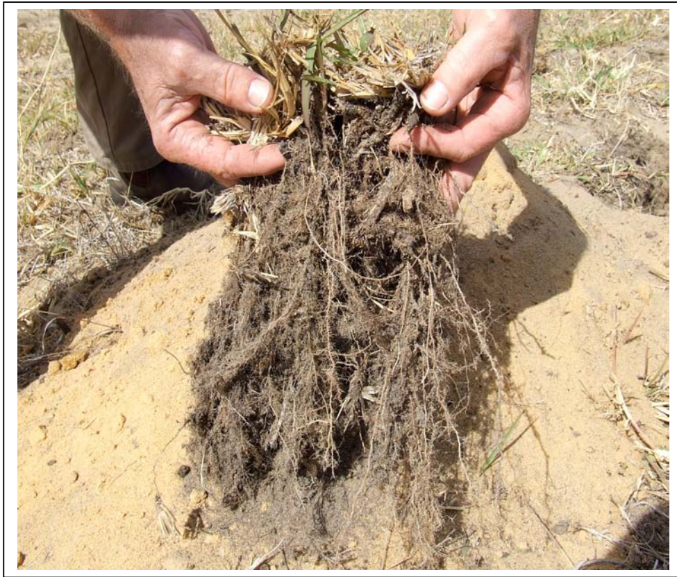
Fig. 1. The dark coloured carbon sequestered around the roots of perennial grasses is readily observed in light coloured soils.

Provided the microbial bridge is intact, organic carbon additions are governed by the volume of plant roots per unit of soil and their rate of growth. The more active green leaves there are, the more healthy roots there are, the more carbon is exuded. The breakdown of fibrous roots pruned into soil through rest-rotation grazing can also be an important source of carbon in soils.