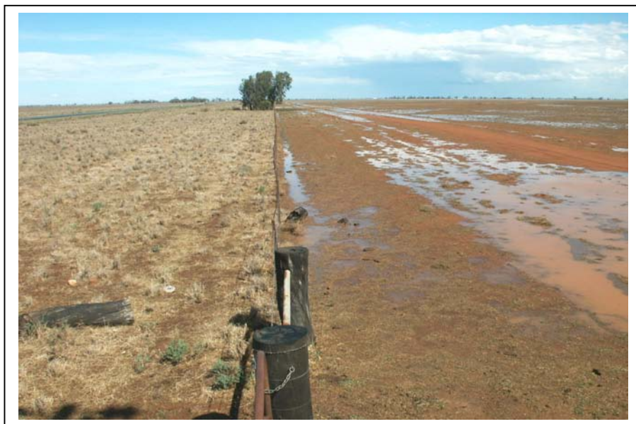
Fig.1. The well grassed area on the left has good infiltration compared to the over-grazed area on the right, which has lost soil carbon and soil water-holding capacity. Rainfall that cannot infiltrate simply sits on top of the ground and evaporates. (Photo Patrick Francis).

The longer we delay undertaking changes to land management, the more soil (and soil carbon and soil water) will be lost, exposing an increasingly fragile agricultural sector to escalating production risks and vulnerability to climatic extremes.